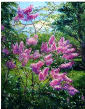
Lilacs